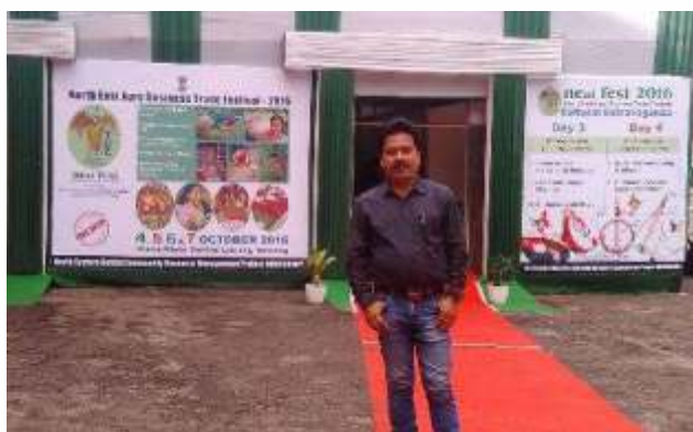
October 4th -7th, 2016 Neat Fest (North East Agro Business Trade Festival)