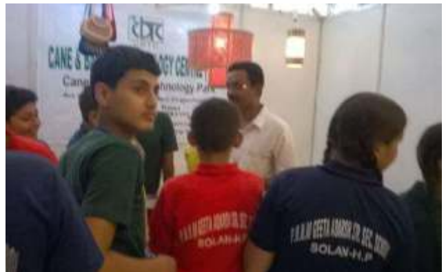
Students visiting the stall