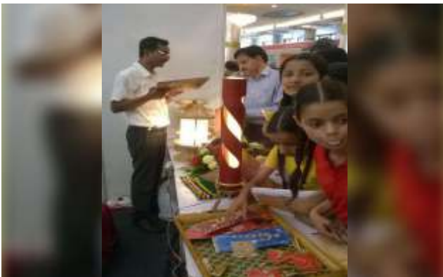
Interaction with School Students