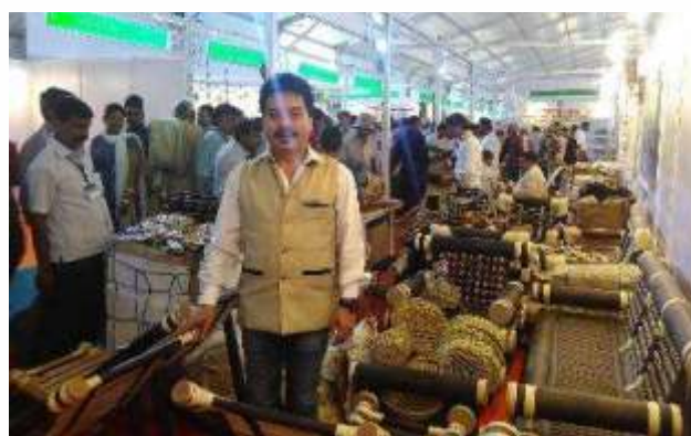
April 8th – 10th, 2016 Global Bamboo Summit

b) 5th Science Exhibition 2016 at Solan, Himachal Pradesh from 18th to 20th July, 2016