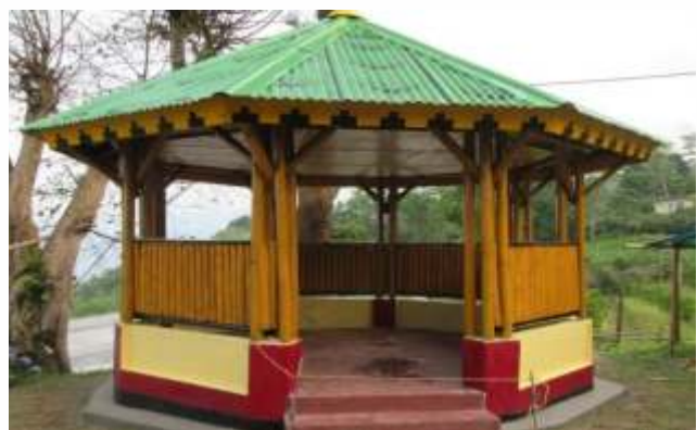
Training on Innovative Bamboo Housing and Construction in Sikkim from 20th April to 21st May, 2016