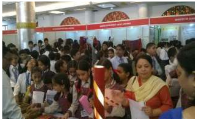
Interaction with School Teachers and Students