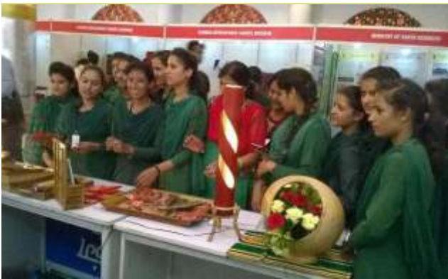
Interaction with Solan Girls Poly Technique Students