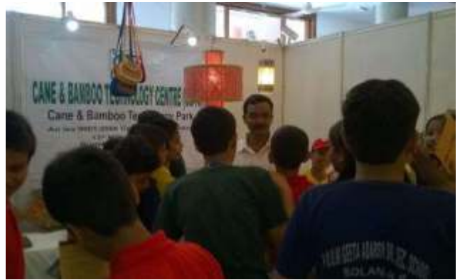
Interaction with School Students