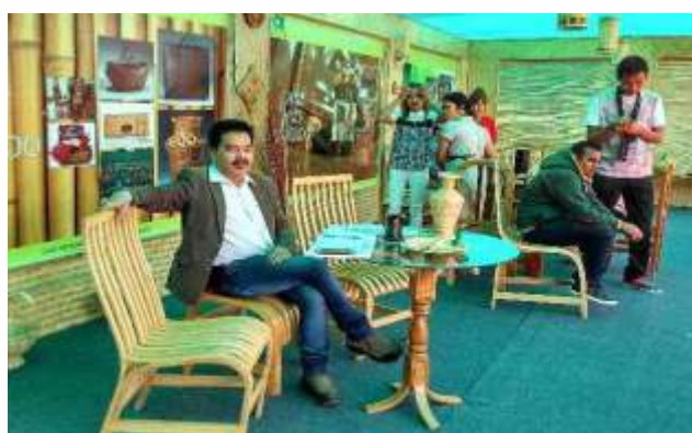
March 6th -8th, 2017 Destination North East, Chandigarh