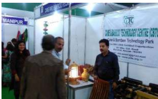
October 4th -7th, 2016 Neat Fest (North East Agro Business Trade Festival)