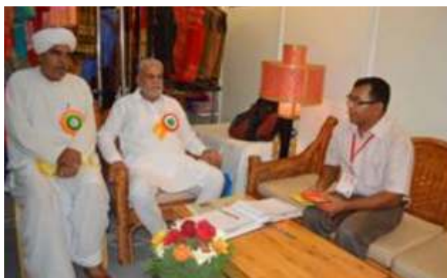
CBTC stall visited by the Hon'ble Minister of State for Agriculture & Farmers Welfare, Govt. of India