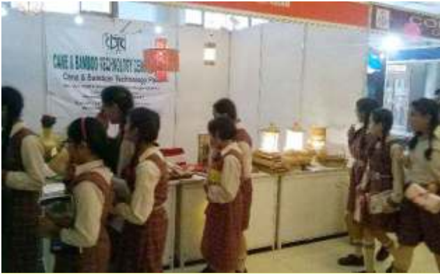
Interaction with School Students